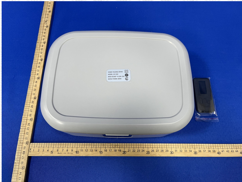
Photo 2 Overall view of the EUT