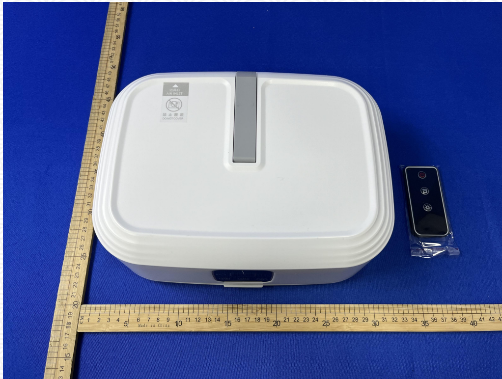
Photo 1 Overall view of the EUT